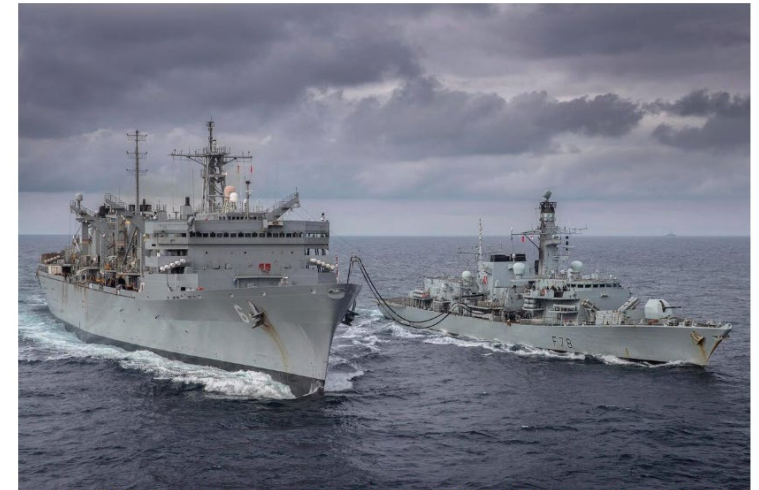
The Duke-class frigate HMS Kent (right) takes part in a replenishment-at-sea with Supply-class fast combat support ship USNS Supply (T-AOE-6) while on exercise with the U.S. Navy in the Arctic Circle.

Four U.S. Navy ships and a U.K. Royal Navy ship sailed into frigid Arctic waters of the Barents Sea on May 4